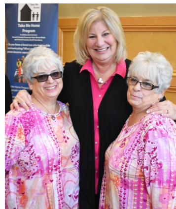
WAKR sponsored Valentine's Day senior luncheon at St. George Fellowship Hall.

Visit our Senior Safety Website: www.co.summit.oh.us/prosecutor