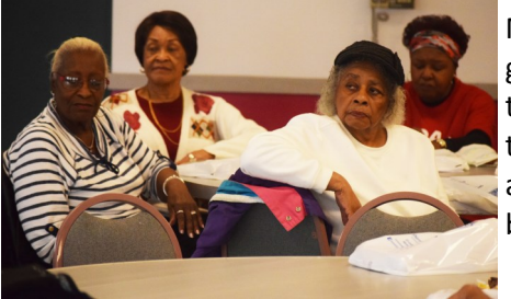
Members of the group learned how to be more aware of their surroundings and how to avoid being scammed.

meeting at the Lawton Street Community Center.