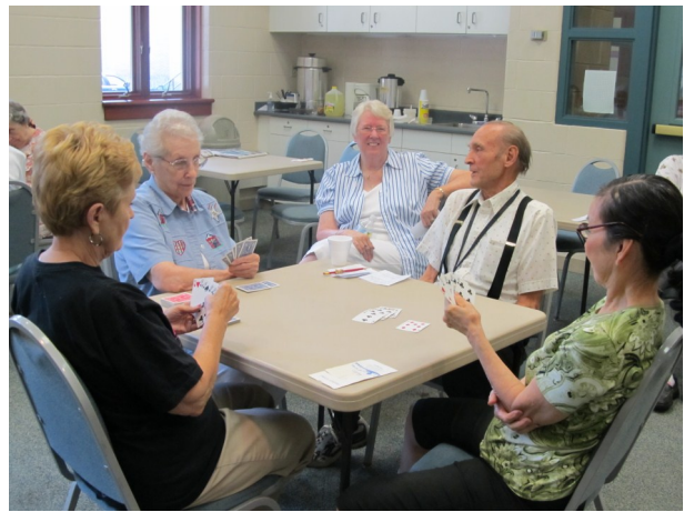
A group of seniors enjoying a card game at the Ellet Community Center.