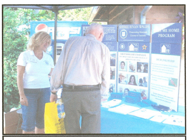
Over 2,000 people attended the Akron Zoo Senior Safari last year. It was a great event and we hope to see you at our booth on September 3,