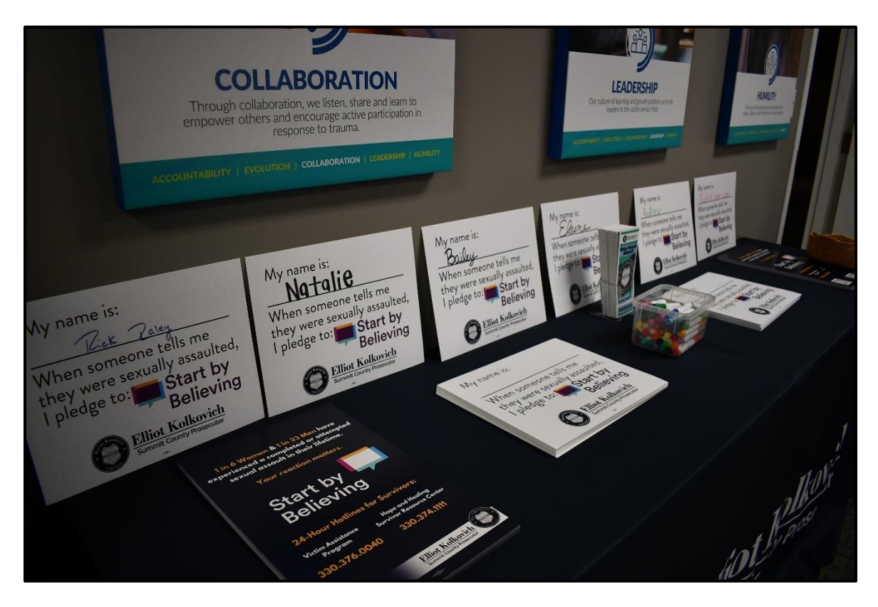
Turn Summit County Teal to Support Survivors of Sexual Violence

AKRON, OH – Today, Summit County Prosecutor Elliot Kolkovich, along with a local survivor of sexual violence, and other community leaders launched the 2025 Start By Believing campaign in Summit County. The annual campaign, created by End Violence Against Women International (EVAWI), aims to change the way society responds to disclosures of sexual violence and abuse. It encourages individuals, communities, and institutions to take a supportive approach when survivors come forward. At the press conference,