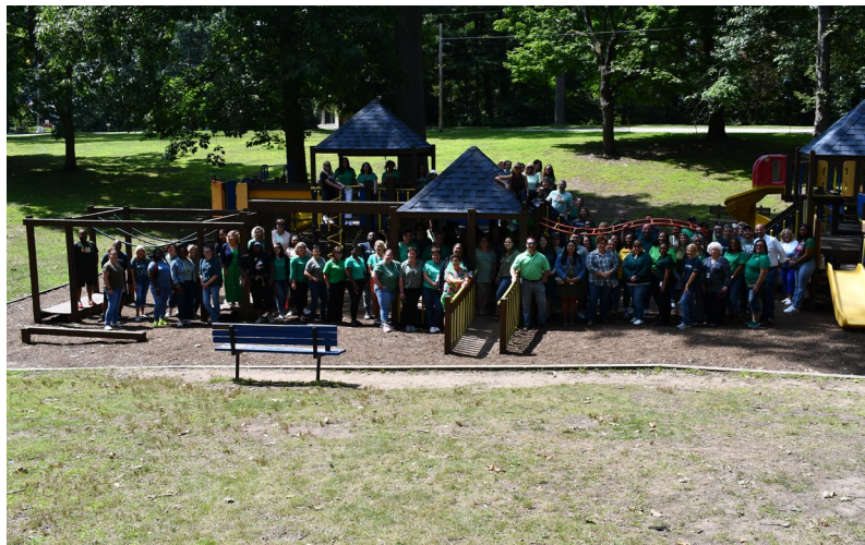
The dedicated staff of CSEA