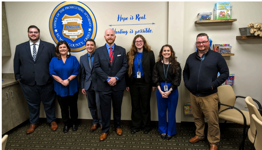
Members of the Office dressed in blue to raise awareness about child abuse prevention.